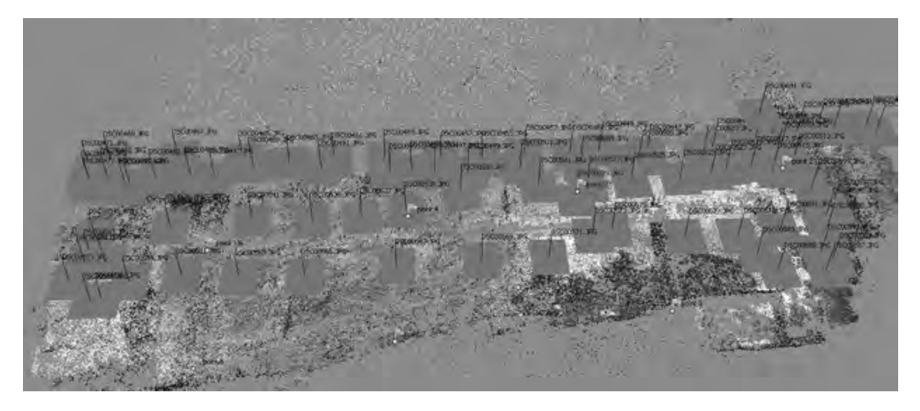
FIG. 5. ALIGNMENT OF IMAGE DATASET.

autonomously with the integrated GPS navigation system. The hexacopter is less affected by atmospheric conditions, making the system more versatile in archaeological fieldwork.