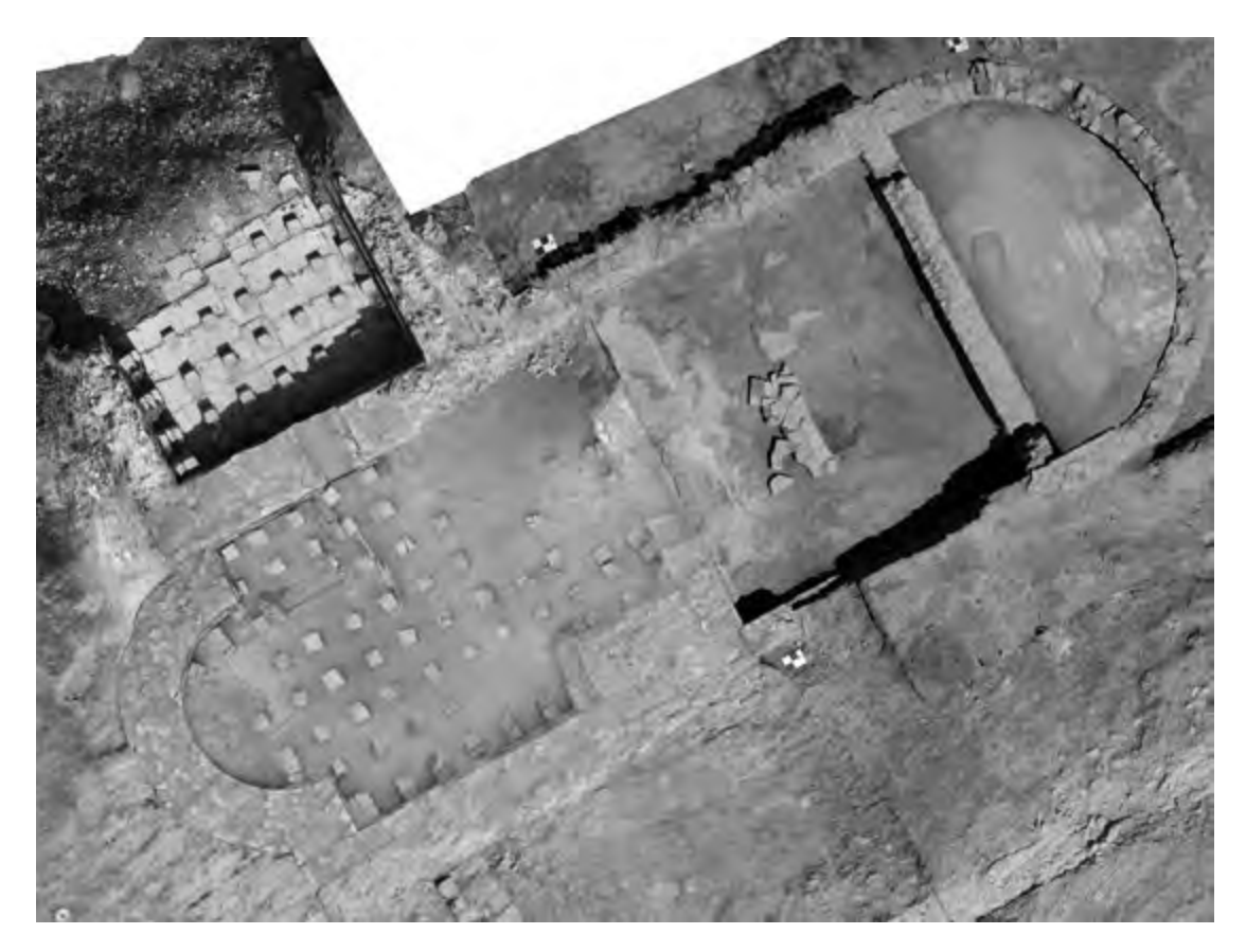
FIG. 7. DIACHRONIC MOSAIC OF ORTHOPHOTOS ACQUIRED DURING TWO YEARS OF EXCAVATION.