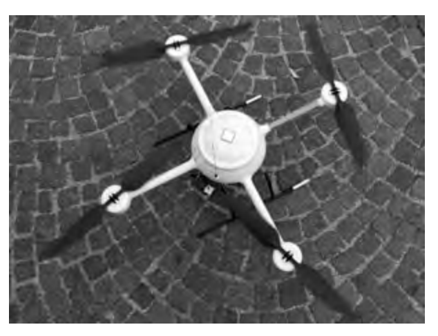
FIG. 3. MICRODRONES MD 200.

uses a grid of known points to maximize the accuracy in the coordinates' transformation process. During the fieldwork the total-station is used for surveying the stratigraphic unit limits, as well as the control points used in photogrammetric process. The instrument is oriented using the GCP on the ground, getting all the surveyed points directly in Gauss-Boaga coordinate system. It enables the excavation to be carried out with no postprocessing operation, producing a documentation that can be related in real-time to the geophysical prospection, used to plan the first excavation areas and the further interventions.