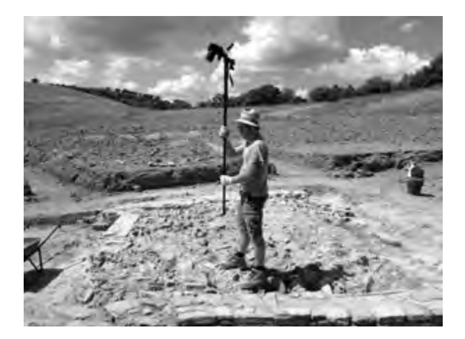
FIG. 2. MONOPOD USED IN TERRESTRIAL IMAGE ACQUISITION.