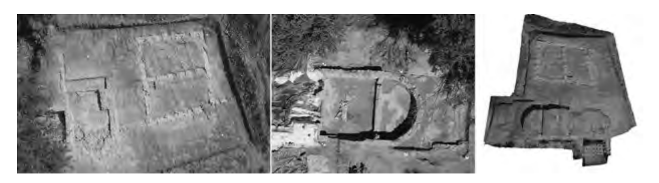
FIG. 6 A-B. AERIAL IMAGE AND DIACHRONIC MODEL WITH TEXTURE OF THERMAL AREA OF SANTA MARTA.

example, the rooms excavated in 2013 within the thermal area of Santa Marta, have been covered for conservation reasons. In 2014 it was possible to survey only the area investigated during the same campaign: removing the coverage was too expensive and archaeologists did not have the possibility to see the whole excavated area at the same time. To overcome this limit we proceed creating the diachronic model of all the area by integrating different datasets acquired in 2013 and 2014. The integration of dataset has been creating following this steps: