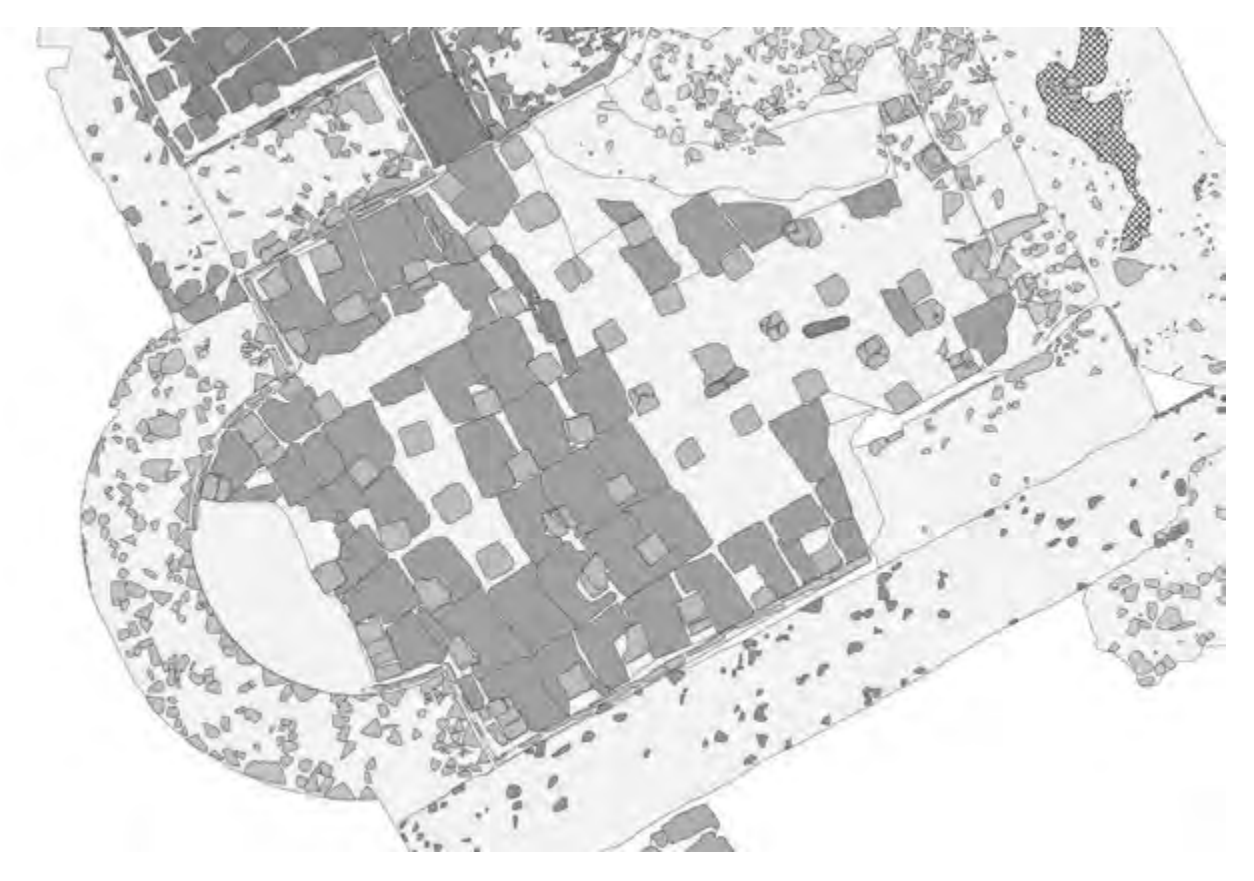
FIG. 9. INTERPRETATION AND VECTOR DRAWINGS.